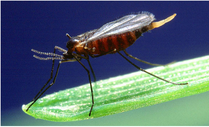
Figure 1. Hessian fly adult