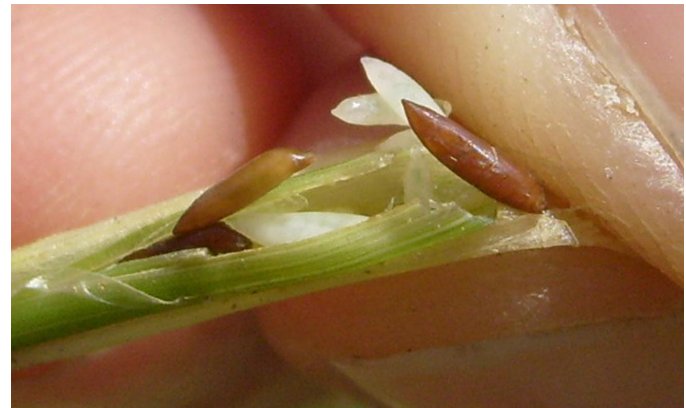
Figure 5. In heavy infestations, many Hessian flies can be found behind a single leaf sheath.