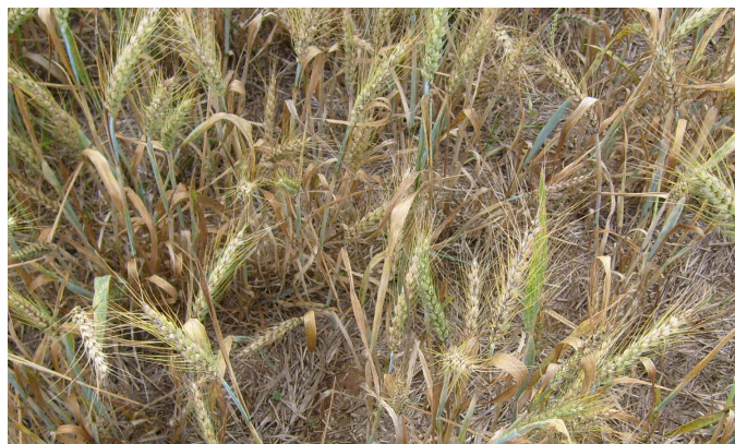
Figure 7. Thin stand and stunted plants resulting from a severe Hessian fly infestation

symptoms. Stunted or dead tillers (Figure 6), and thin wheat stands are typical signs of early season infestation (Figures 7 and 8). Stunted vegetative tillers are often dark green and sometimes have a blue tinge. Leaf blades on infested tillers are wider and shorter than normal, and leaf sheaths are shorter (Figure 9). If tillers that were infested when they were small survive and produce grain heads, the heads are small and the stems are stunted.