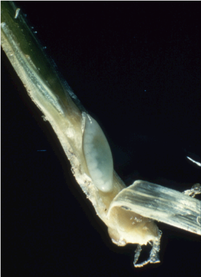
Figure 3. Hessian fly larva