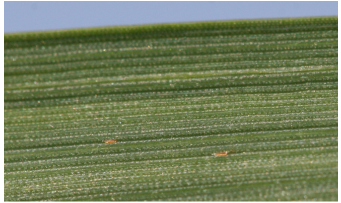
Figure 2. Hessian fly eggs on a leaf

H essian fly, Mayetiola destructor (Say), is a serious pest of winter wheat in the southeastern United States. Severity of Hessian fly infestation varies from year to year and by location. Outbreaks of this insect have occurred periodically in the United States since its introduction the mid-1800s. The Hessian fly is believed to have been introduced into Long Island, New York, in straw bedding used by Hessian soldiers during the Revolutionary War. Hessian fly prefers to feed on wheat, but may also infest triticale, barley, and rye. Hessian fly does not attack oats or ryegrass. In the coming years, entomologists expect the risk of economic losses from Hessian fly to continue. Reasons for this include adoption of crop rotation schemes that lead to planting wheat in the same field in consecutive years, use of wheat as a cover crop, shifts to an earlier wheat planting date, and increased wheat acreage. Emergence of Hessian fly biotypes that overcome resistance in most wheat varieties has led to supply shortages of wheat varieties resistant to Hessian fly. This publication discusses the biology of the Hessian fly and provides suggestions for managing this insect.