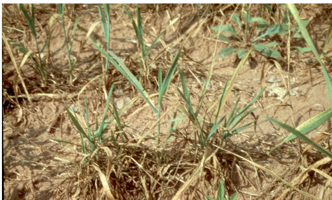
Figure 6. Dead and stunted tillers caused by an early infestation of Hessian fly