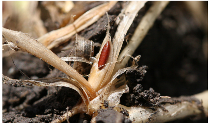
Figure 4. Hessian fly puparium (flaxseed) at the base of a wheat plant