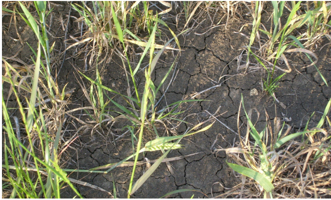
Figure 8. Thin stand and stunted plants resulting from a severe Hessian fly infestation