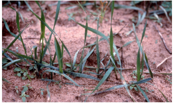
Figure 9. Wheat tillers that are infested early have shortened leaf sheaths

genes. To be effective, wheat varieties must be specifically resistant to the local Hessian fly genotype. In addition to the information provided at the additional information link, growers can get information on Hessian-fly-resistant varieties from their local land-grant university. In most cases, varieties rated as having “good” resistance should provide enough protection to avoid economic losses due to Hessian fly. In areas with severe Hessian fly problems, the use of resistant and tolerant varieties may not be sufficient to prevent infestations from occurring.