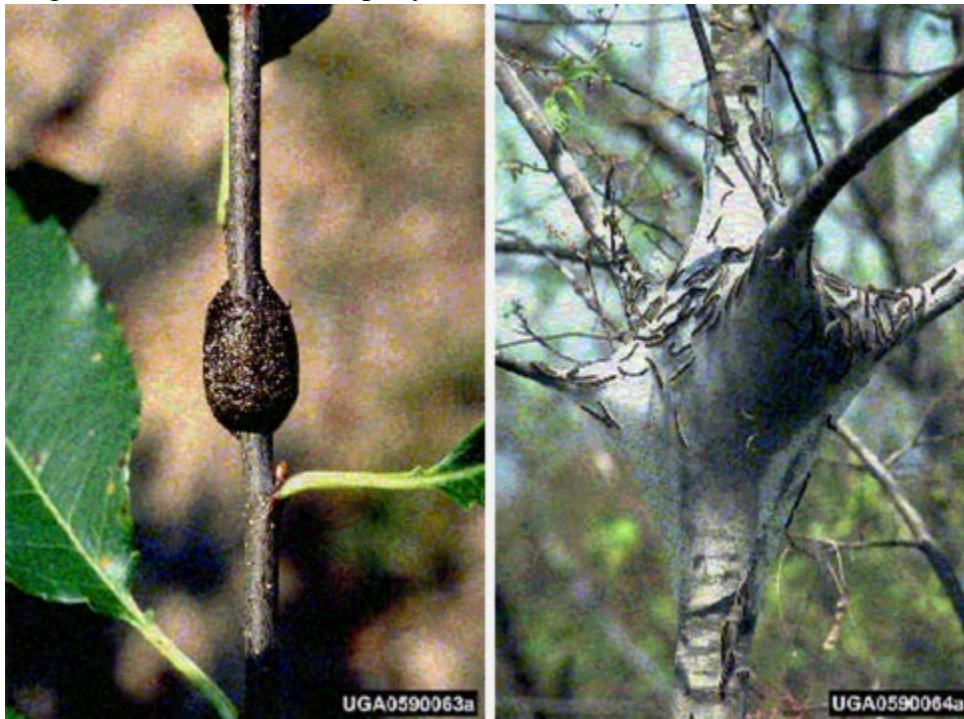
ETC Egg Mass (left) and Tent (right)

The larvae are generally black with a white stripe down the back. On the sides of the insect there will be blue spots located between two yellowish lines. This insect pupates inside of whitish-colored cocoons that may be found on tree trunks, fences or buildings. The adults will emerge from the cocoons in late June or early July. The moths are reddish-brown and have two whitish stripes running across each wing. There is only one generation of this insect per year.