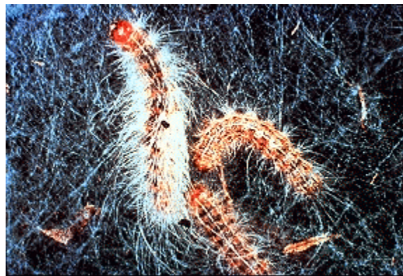
Fall Webworm Larva

The fall webworm is a pest that is distributed throughout most of the United States and Canada. It will feed on almost all shade, fruit and ornamental trees except for evergreens. In Kentucky some of the preferred trees include American elm, maples, hickory, and sweetgum.