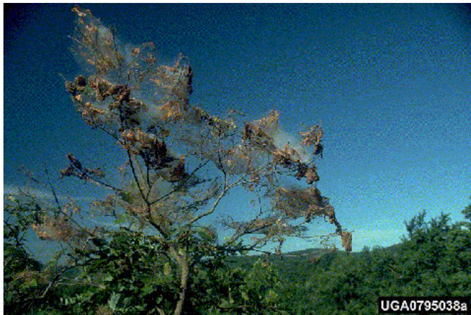
Fall Webworm Tent

The first generation of caterpillars start to feed sometime in mid-spring to early summer. After feeding, they pupate in the soil and a second generation of webworms will be observed during August or September. The second generation of webworms usually causes more defoliation than the first generation.