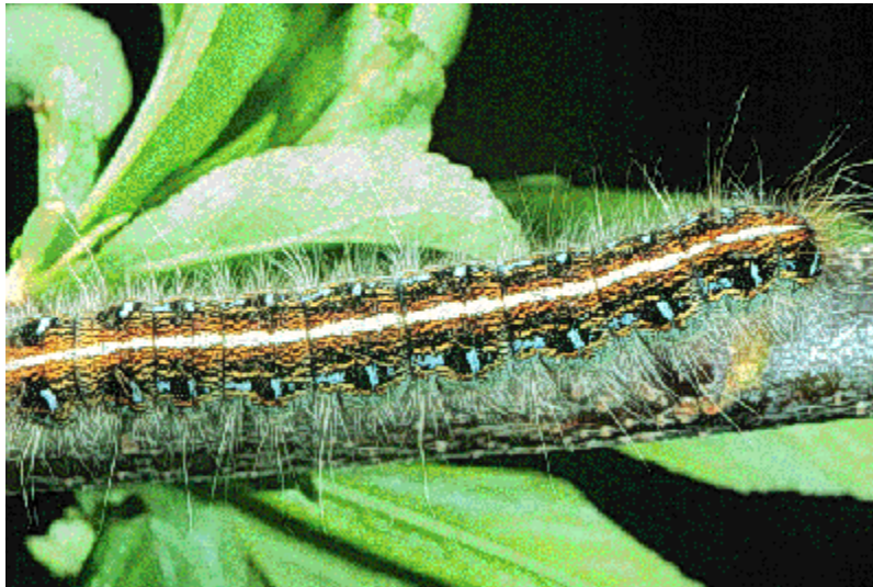
Eastern Tent Caterpillar (ETC) Larva

The eastern tent caterpillar is a native insect that was first reported in 1646. Large numbers of this caterpillar usually occur in intervals of about ten years. Before the gypsy moth was accidentally introduced into the US, the eastern tent caterpillar was considered to be one of our most important pests of shade trees.