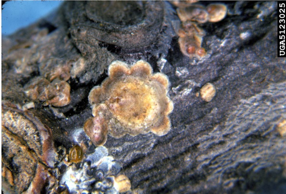
Walnut scale females may have males that settle near them. As their waxy armor grows together, there can be characteristic "daisies" that form.

scales will settle near the edge of female waxy covers and proceed to develop there. As a result, their armor and the female armor seem to converge into a daisy shape that helps to positively identify this pest.